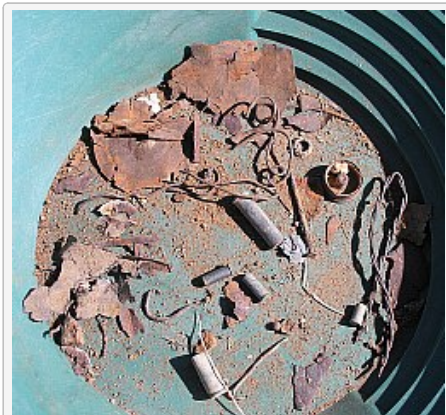
Last trash from 2009